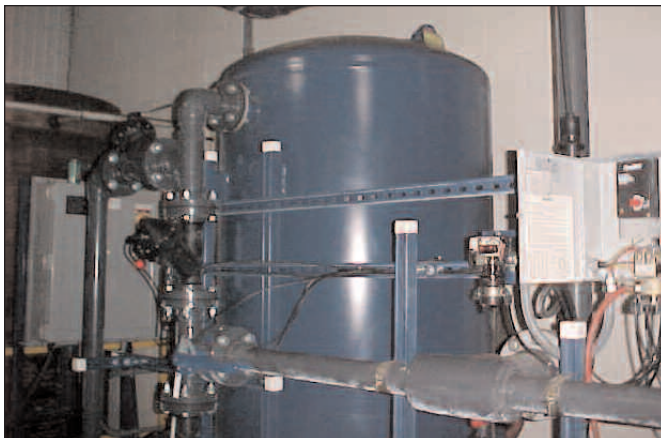
Above: Multimedia filter. Right: Duplex water softener.

P.S. Here is some of the equipment I'm talking about. I suspect it looks familiar to you and you have often wondered how you could add it to your service list. I think you will find WaterScience Service the perfect solution.